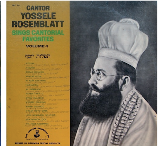
Album covers from two of the most outstanding chazzanim of the last century, Yossele Rosenblatt and Zevulun Kwartin.

touched by their singing and he "always dreamed of being a chazzan ."